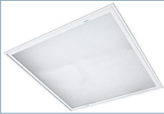
HERMETIC 418 K58 OP HF