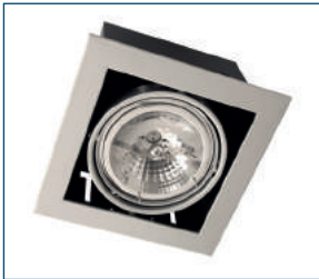
PEGASUS 150 B29