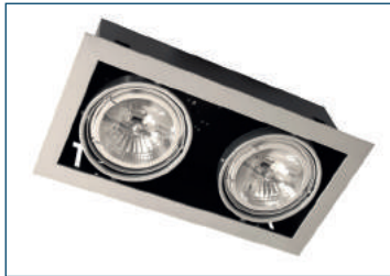
PEGASUS 250 B30