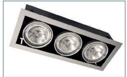
PEGASUS 350 B31

Type: A range of elegant recessed adjustable spotlights for halogen lamp, providing unique interior design solutions. Ideal for areas requiring good colour rendering and high lighting levels.