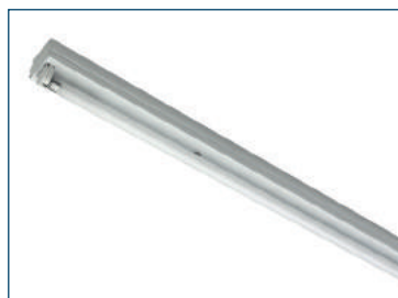
ALCOR 128 A55

Type: Slim T5 batten luminaire incorporating high frequency control gear, giving maximum efficiency and quality of light. Suitable for retail and commercial applications.