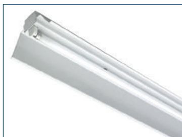
ALCOR 128 A56